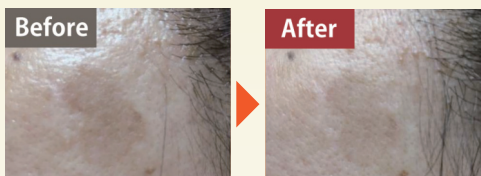
※This is the result after approximately 6 months of using HANJOLIE VC30 Essence (according to our own survey).

After approximately 6 months of using HANJOLIE VC30 Essence, changes in the cheeks.