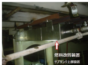
2000 tons Ship