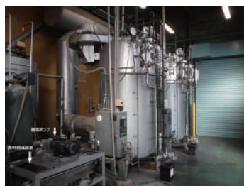
Daio seishi: Boiler