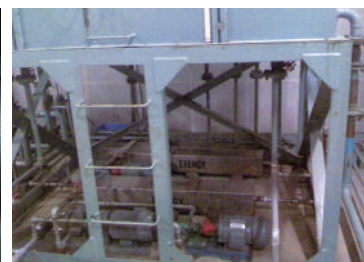
Omron Electronics: Generators

Delivery record (Japanese company in China)