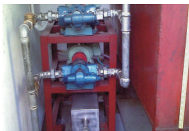
Bridgestone: Equipment & Pumps

Example of installation (Japanese company in China)