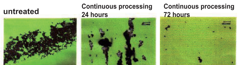
*Chinese oil (heavy oil)